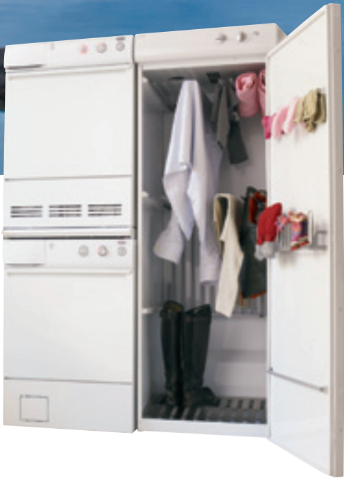
UltraCare Drying Systems Drying Cabinets, Vented & Ventless Dryer